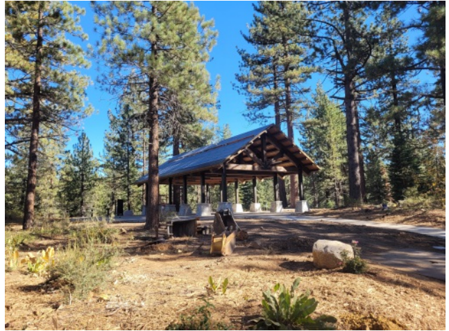
Event Pavilion Completed

Project Fact Sheet Data as of 05/17/2024