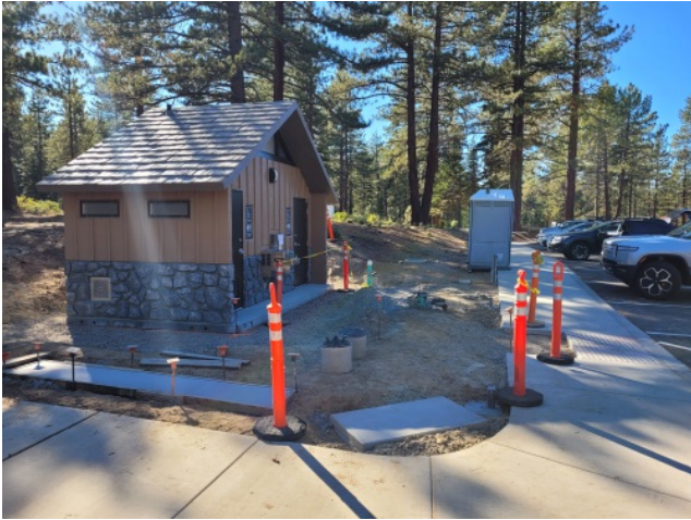
New CXT Flush Restroom in Upper Parking Lot