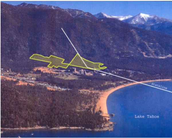
Van Sickle Bi-State Park