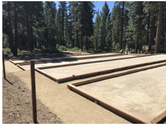
Completed Bocce Courts

The IVGID community-identified new bocce courts as a priority community service project. The courts were constructed in a community park for all members of the public to enjoy. The project included the construction of four (4) bocce courts, enough to host small tournaments or support a local league. The court complex allows the community to enjoy bocce locally, instead of driving out of town to seek these opportunities, adding a new recreation opportunity.