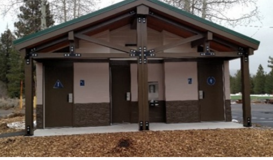
New Upper Parking Lot Year-Round Restroom