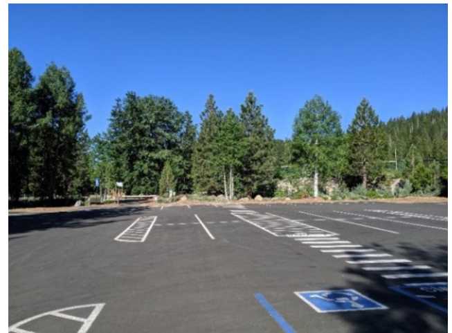
New Upper Parking Lot Trailhead