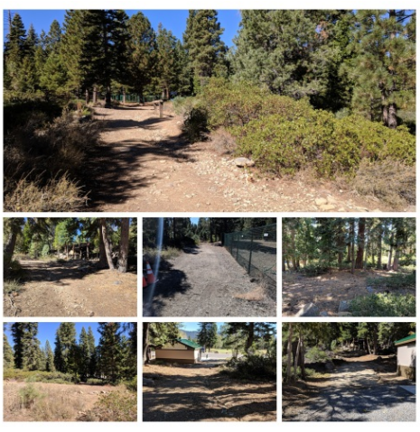
Existing compacted dirt path to tennis courts and Tahoe Unleashed dog park