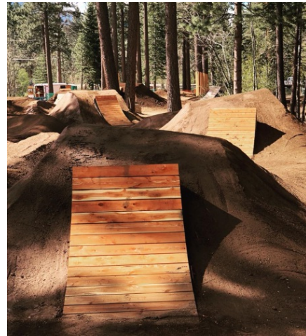
Bike Park Jumps