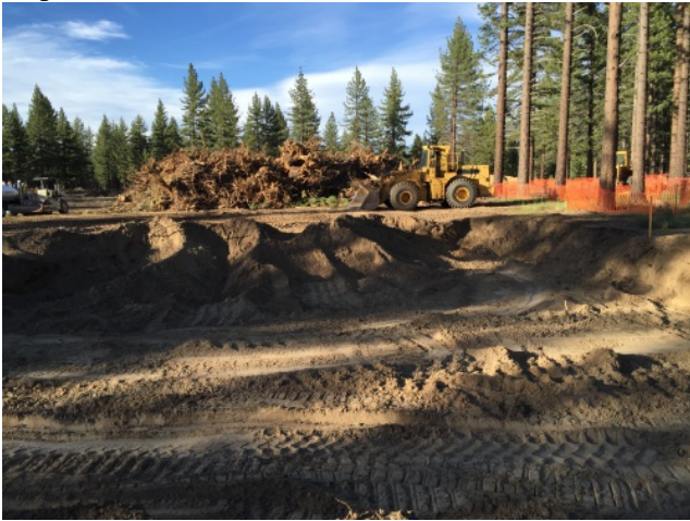
6-8-16 Rough Grading Play Fields looking NE