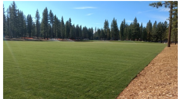
Newly placed Sod on 4 acre fields

Construct new play fields on City and College property located adjacent to South Tahoe Community College. The project consists of 4 acres of new natural grass to accommodate two FIFA standard soccer fields and other community play activities.