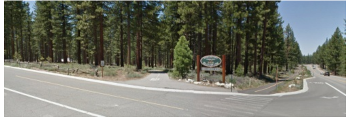
Entrance Road and signage for Community Play Fields.