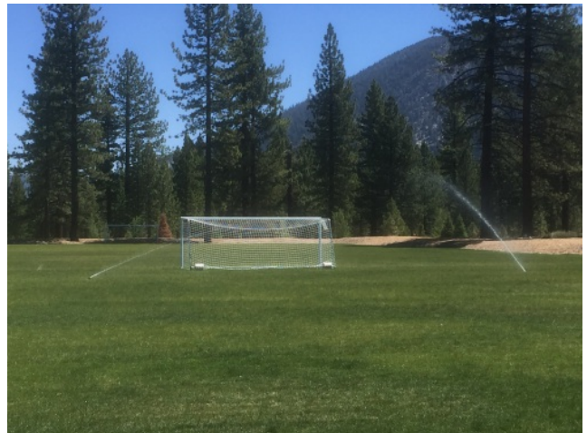
Irrigation of Play Fields 2018 post Snowglobe17 repairs