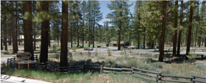
Community Play Fields Expansion to be constructed to the right of existing soccer field as seen from parking lot looking towards existing LTCC Field