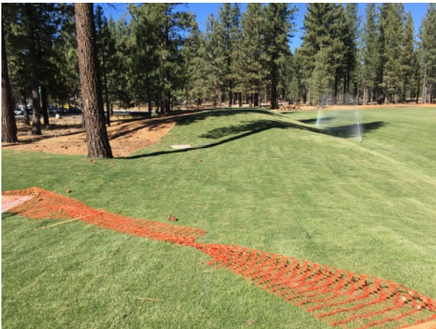
Post Construction sod freshly placed on berm field in background