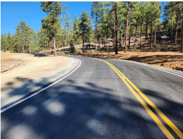
New Access Road (Facing East)