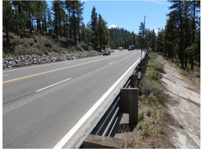
US 50 Facing South Near Proposed Intersection