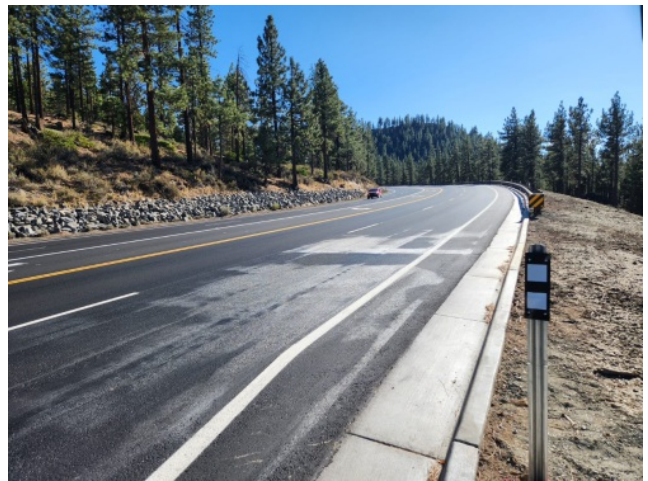
US 50 (Facing South)