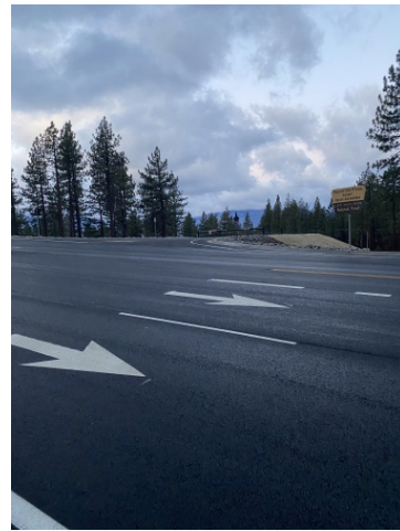
New Access Road Intersection with US 50 (facing west)

Reconfigure resort entry/intersection with Highway 50 to eliminate existing safety concerns and improve access to the recreation site.