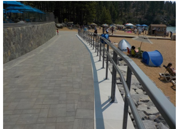
Roundhill Access Ramp