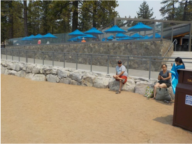
Access Ramp from Beach