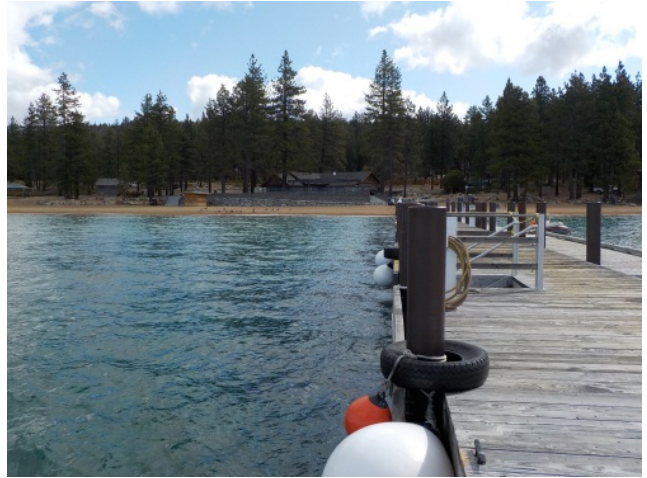
Finished Restaurant and Pavilion

Project Fact Sheet Data as of 05/16/2024