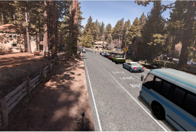
SR 89 Transit Priority Lane Conceptual Rendering

Project Fact Sheet Data as of 11/15/2024