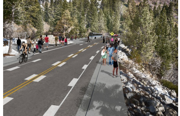
Emerald Bay Conceptual Rendering

The project completed the SR 89 Recreation Corridor Management Plan and is implementing its recommendations. Improvements include completion of the Tahoe Trail (west shore), Transit & reservation system during the summer months and peak weekends, safety and parking management.