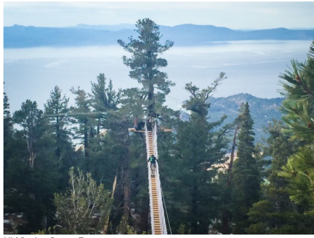
Mid-Station Canopy Tour