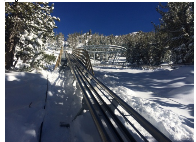
Coaster Winter After