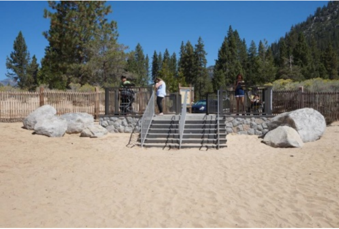
Completed overlook at Sand Harbor

Project Fact Sheet Data as of 05/19/2024