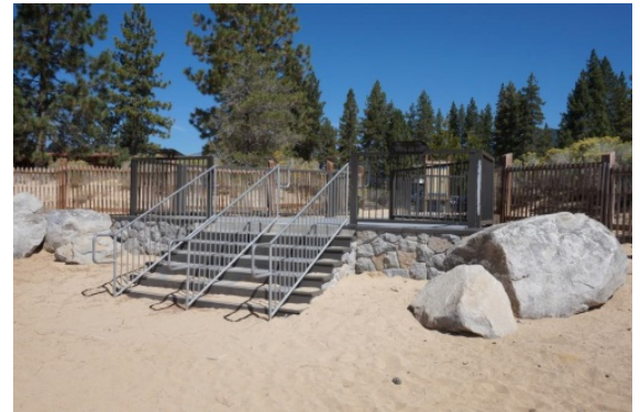
Sand Harbor Scenic Overlook