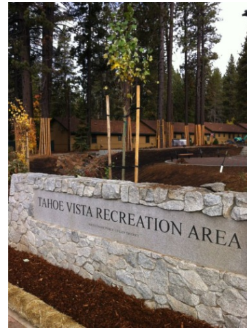
Tahoe Vista Recreation Area Frontage Sign