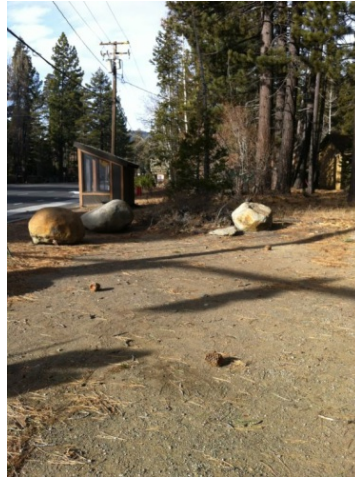
Tahoe Vista Recreation Area before project