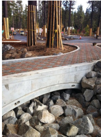
New Path at Tahoe Vista Recreation Area