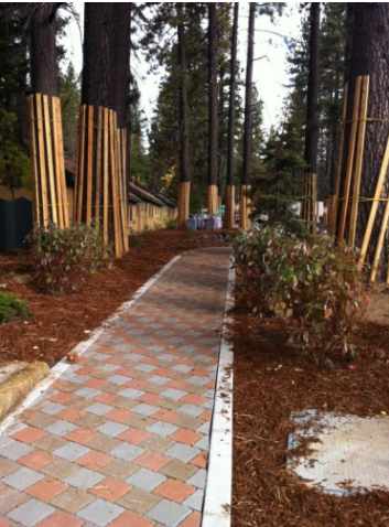
Path at Tahoe Vista Recreation Area