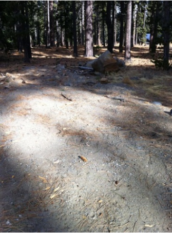
Tahoe Vista Recreation Area before project