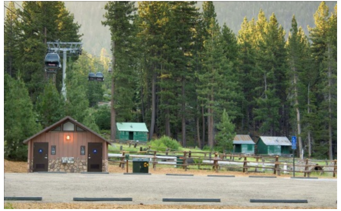
New Restrooms at Van Sickle Park