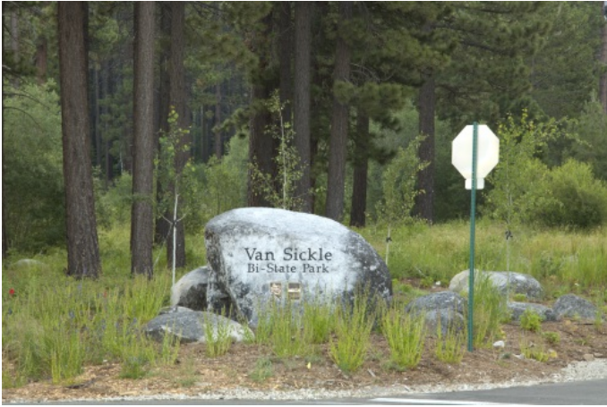
Van Sickle Bi-State Park Entrance