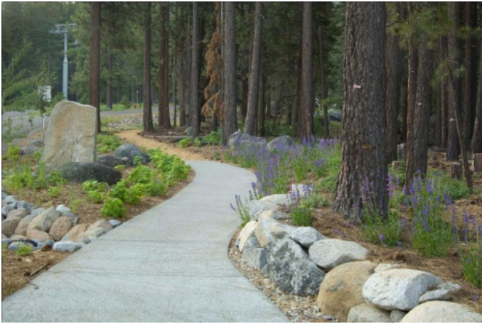
Van Sickle Park New Path