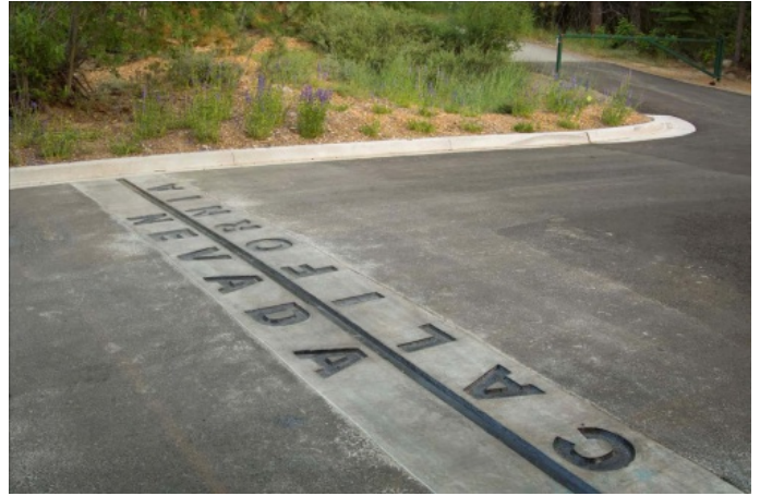
Van Sickle Road at State Line