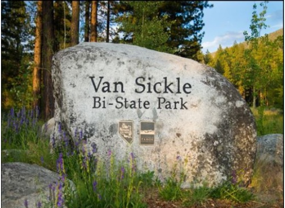
Van Sickle Entrance

Phase 1A of the California/Nevada bi-state park included construction of a road to day use area with 26 parking spaces, 6 equestrian parking spaces and SST bathroom on the Nevada side, and an entrance road and 10 parking spaces near the interpretive barn on the California side, and underground utilities to support subsequent phases.