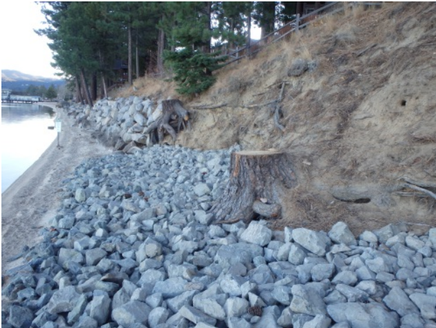
Fremont Overlook shoreline protection (11/18/2019)