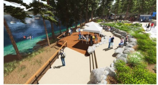
LAKEVIEW LOOKOUT SOUTHWEST LAKE, CALIFORNIA • CALIFORNIA TAHOE CONSERVANCY