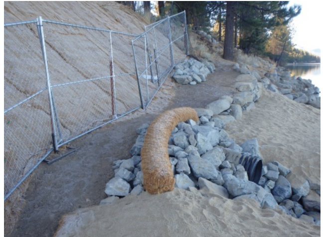
New outfall pipe (11/18/2019)

Project Fact Sheet Data as of 05/15/2024