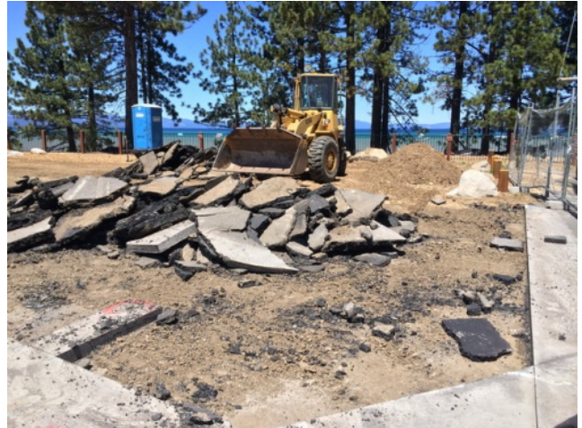
Demolition of former Alta Mira parking lot