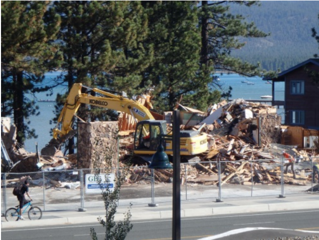
Demolition of former Alta Mira building