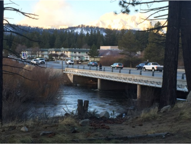
Upper Truckee River at Highway 50 bridge, December 29, 2016