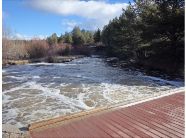
Truckee River ridge at Johnson Meadow, January 2017