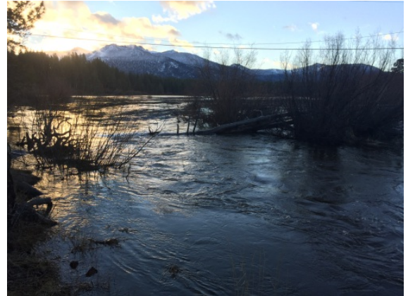
Upper Truckee River at Highway 50 bridge, looking upstream into Johnson Meadow, December 29, 2016

This project included the acquisition of a 206+ acre meadow property along the Upper Truckee River. Significant restoration opportunities (See EIP Project #01.02.01.0030 Upper Truckee River Johnson Meadow Restoration Project) will be pursued following acquisition, including filling an erosive gully channel and restoring the main river channel to function more naturally and benefit water quality and wildlife habitat. Dispersed public recreation opportunities will be provided with a future project.