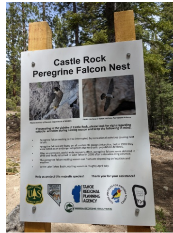
Permanent sign at trailhead.