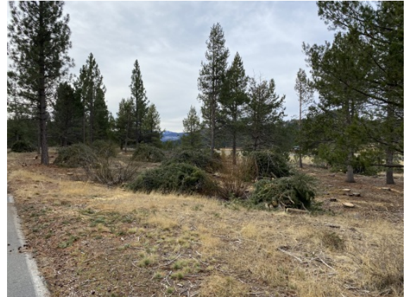
Less than 14 " dbh trees for prescriptive burning on Airport Property

California Conservation Corps (CCC) were hired by the Airport to perform forest health hazardous fuels reduction on trees located outside of the Stream Environment Zone. Treatment occurred in 2020 and 2021 concluding in November 2021 (South Lake Tahoe Airport Improvement Project). All trees were hand cut and stacked into burn piles for future prescribed burn after wood has cured. El Dorado AQMD permits must be secured prior to any ignition. Per TRPA MOU MM a Qualified Exemption is required for this project. CCC will be hired to perform prescribed burns on behalf of the airport.