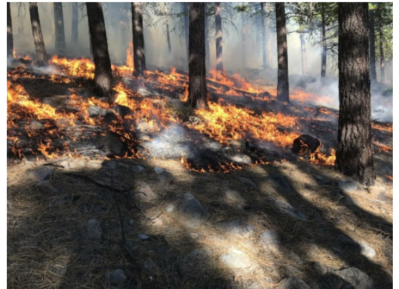
Low intensity prescribed fire