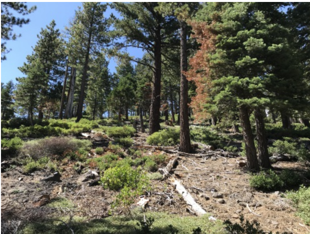
Monitoring Point WF 1-9 After Hand Thinning and Pile Burning