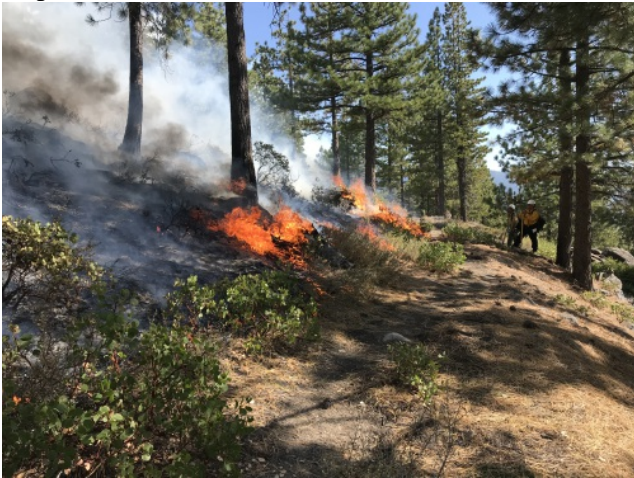
Lower Tyner Understory Fire