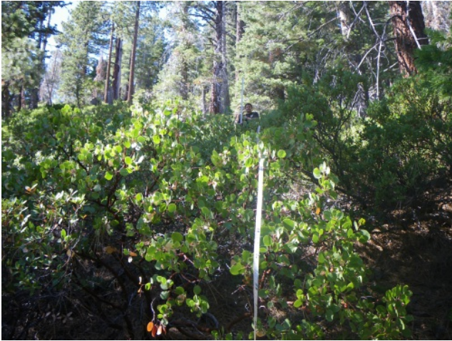
Monitoring Point WF 1-9 Before Hand Thinning