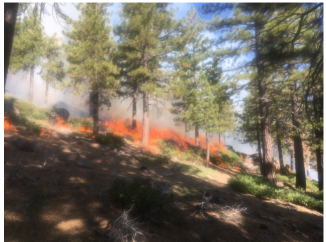
Lower Tyner Understory Fire