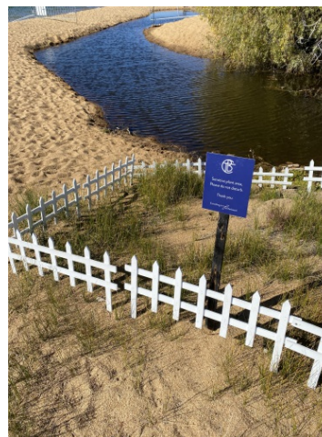
new TYC enclosure at the Tahoe Beach Club