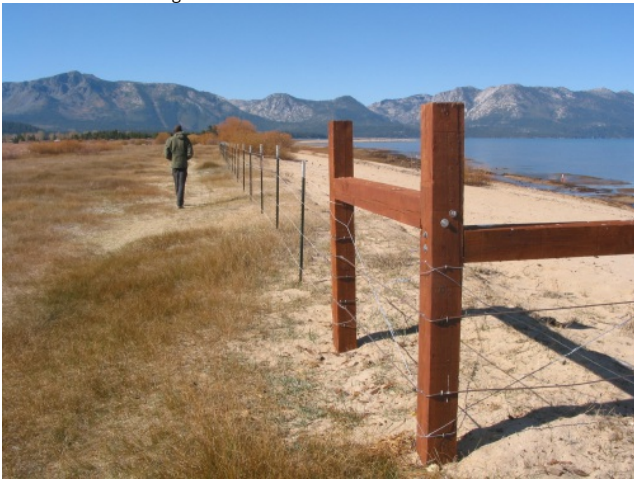
2013 TYC Enclosure