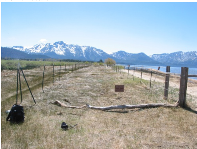
2008 TYC Enclosure