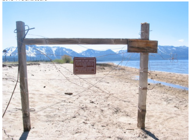
2008 TYC Enclosure Sign