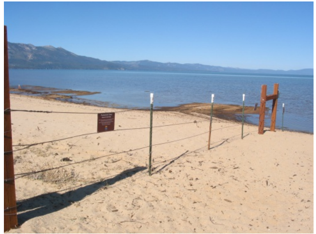
2013 TYC Enclosure