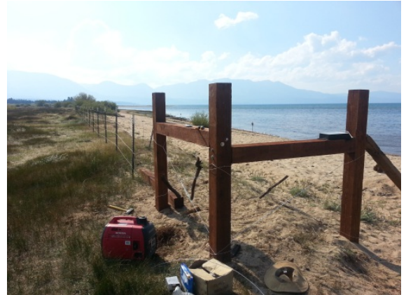
2013 TYC enclosure