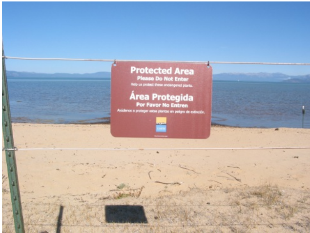
2013 TYC Enclosure Sign