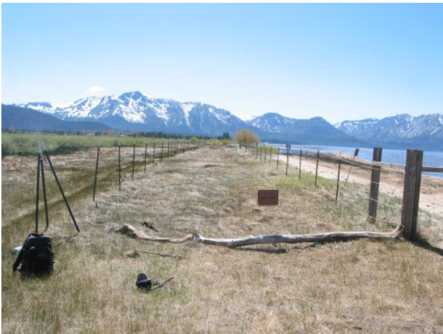
2008 TYC Enclosure