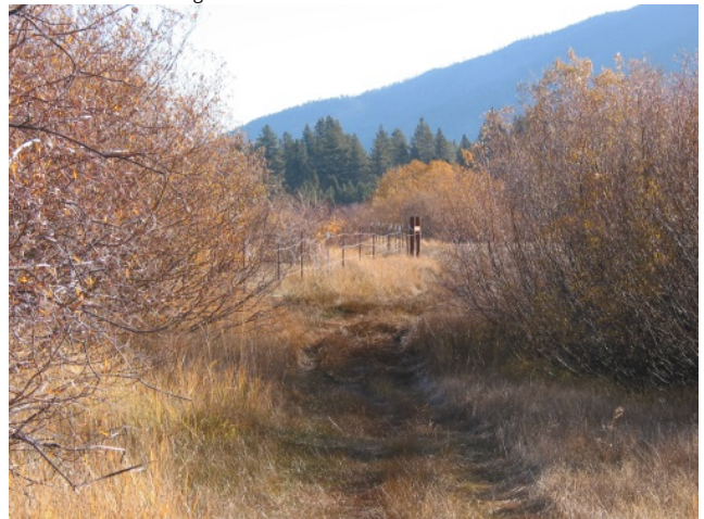
2013 TYC Enclosure