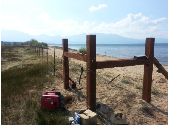
2013 TYC enclosure

Consistent with Tahoe Yellow Cress Strategy and the Tahoe Yellow Cress Management Plan for the Upper Truckee River and Marsh Restoration. This project will construct and maintain protective structures where appropriate along beaches. Includes educational/interpretive displays.