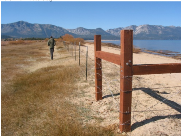
2013 TYC Enclosure