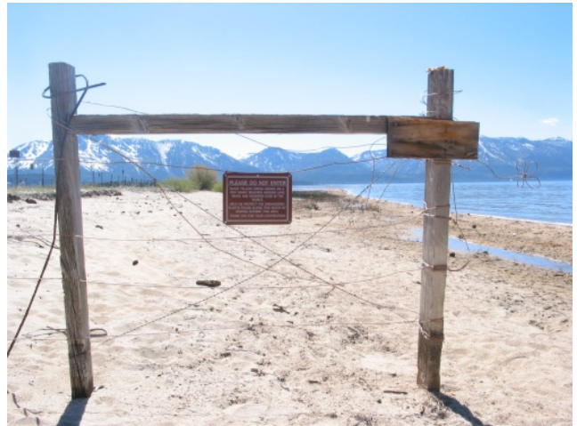
2008 TYC Enclosure Sign