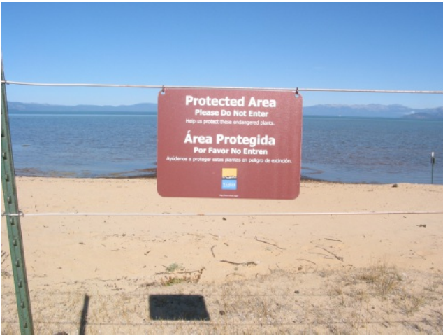
2013 TYC Enclosure Sign