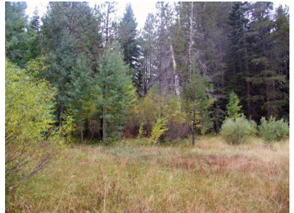
Aspen stand and meadow with conifer encroachment