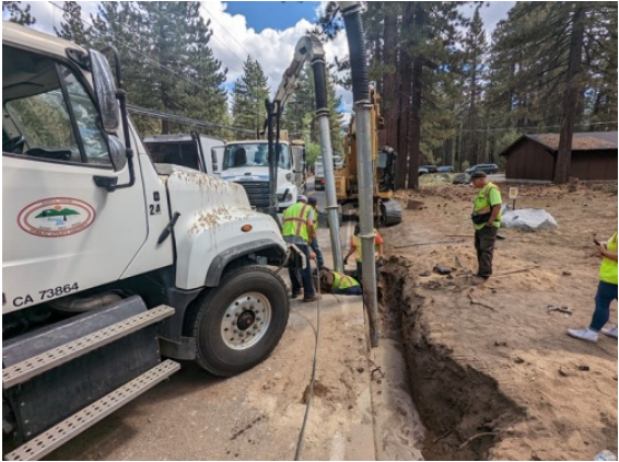
Crews work to repair a water leak found during waterline installation on Black Bart

The Black Bart Project installed 7,700 linear feet of new 6-inch water main to replace the existing 1- and 2-inch diameter steel water main that serves the properties. Nine new fire hydrants would be installed that would be accessible from the public right of way. The project improves water supply enhancing fire protection capabilities on private, local, state, and federal lands by increasing fire flow volumes and coverage area.