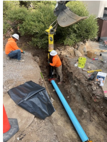
Install new fire hydrant

This Project provides improved fire flow capacity and fire hydrant coverage across the TCPUD water service areas. This phase occurs within the Dollar Point neighborhood, and will replace 1,500 linear feet of water mains and install additional 4 fire hydrants. The objective is to improve water supply enhancing fire protection capabilities on private, local, state, and federal lands by increasing fire flow volumes and coverage area.