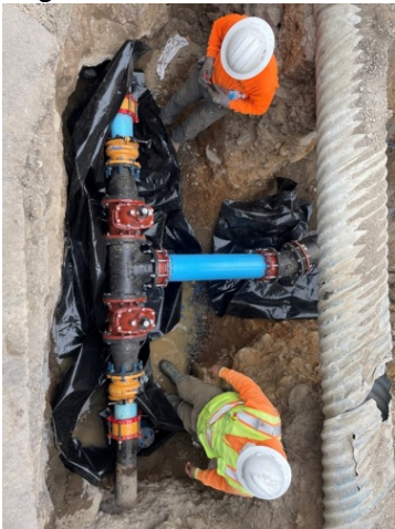
Installing new water line