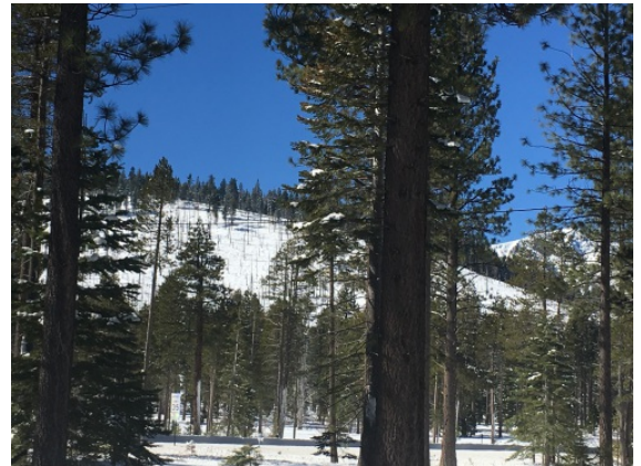
Adjacent USFS land showing the Angora Fire burn area