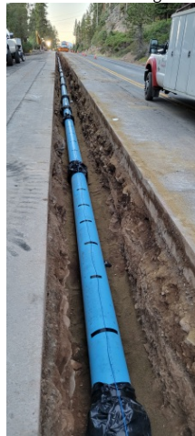
New 12-inch watermain installed in Carnelian Bay

Project Fact Sheet Data as of 05/18/2024