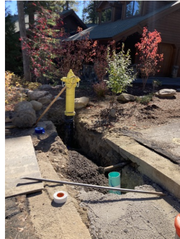
New hydrant installed in Carnelian Bay