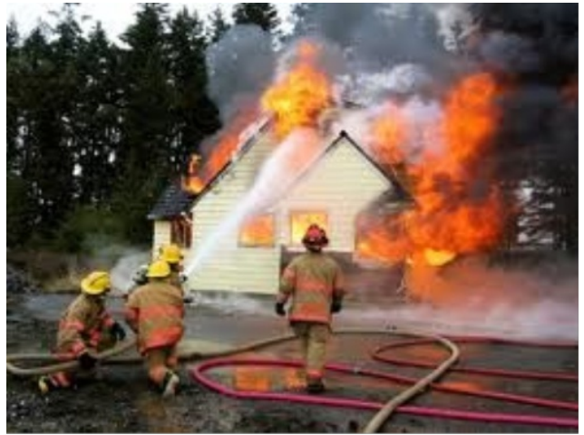
Structure on Fire - Angora Fire