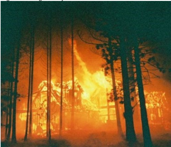
Structure Fully Engulfed - Angora Fire