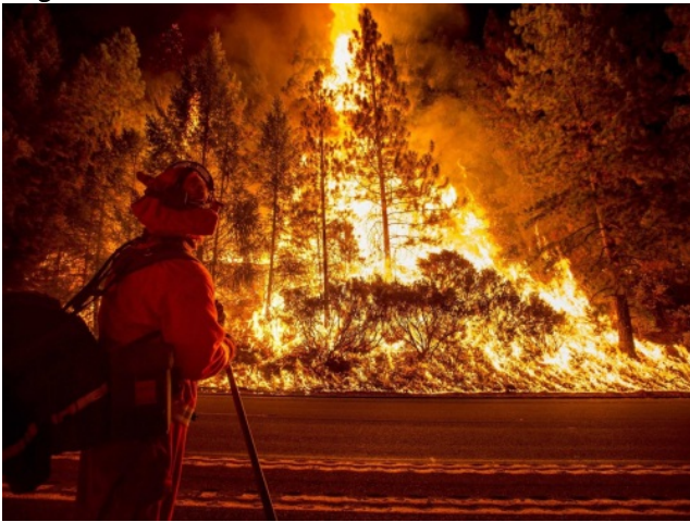
Angora Fire Along Roadway