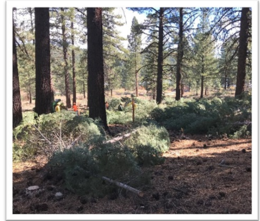
Crews hand thinning and chipping white fir ladder fuels in November 2022. Photo taken in between the new Spooner visitor center & Spooner Lake.