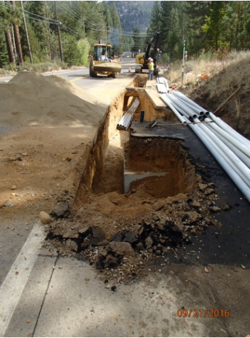
Placement of buried conduit

Project Fact Sheet Data as of 05/08/2024