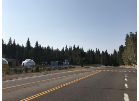
Pioneer Trail near Tahoe Sierra