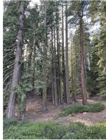
810 Carnelian Circle

Reduce wildland fire fuels across 46 parcels owned by Placer County (53 acres total). The parcels are spread across the WUI area from the CA/NV state line to the Placer County/ El Dorado County line. This project will contribute to community safety and wildfire resilience by hand thinning vegetation, removing ladder fuels, removing hazardous trees, and reducing the buildup of down woody material. The project is funded by the California Tahoe Conservancy.