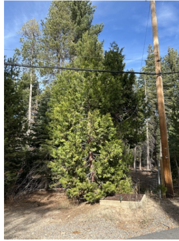
Hilo Ave (near intersection with McKinney Rubicon Springs Rd)

Project Fact Sheet Data as of 04/03/2026