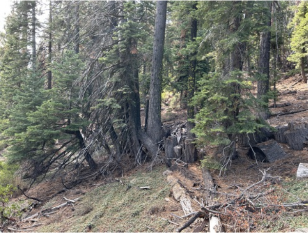
4589 N Lake Blvd