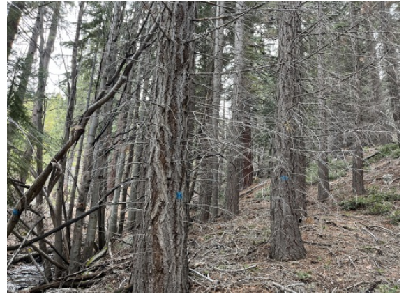
Pretreatment - overstocked forest with minimal understory diversity, and mortality in white fir, willow, alder, and aspen.