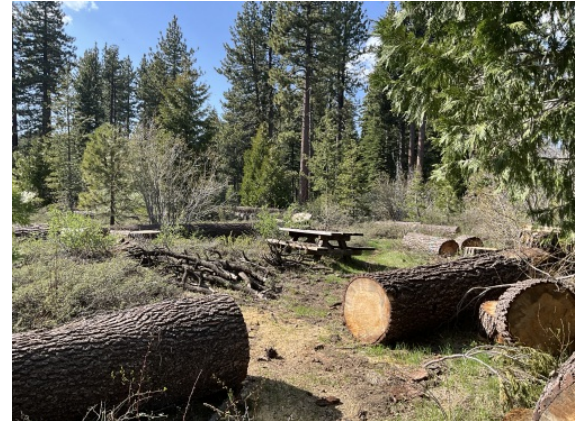
Some removal of downed logs will be taking place to better complete a previous treatment at the 64-acre recreational area.