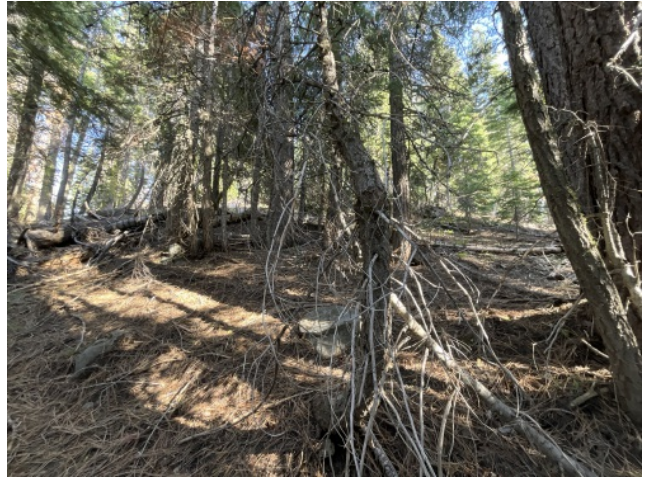
Dead and dying surface and aerial fuels will be cut and piled for burning. This areas is downslope of homes on Kimberly Drive in Tahoe City.

Project Fact Sheet Data as of 05/07/2025