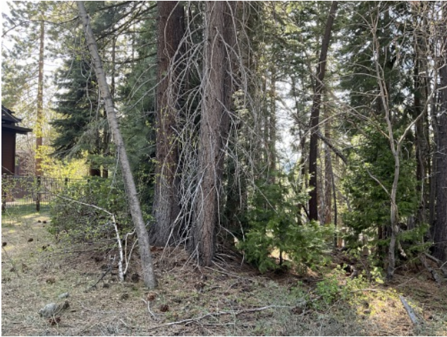
Ladder fuels and sub-dominant trees will be removed for structure protection as well as enhancing forest health.