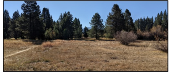
Trout Creek Meadow behind LTCC in 2023 with Lodgepole encroachment.

The Lake Tahoe Community College is interested in reducing the risk of catastrophic wildfire, improving hydrologic function, and restoring lost habitat in the Trout Creek Meadow between Hwy 50 and Black Bart Ave. Ecosystem restoration will include the removal of ~20 acres of lodgepole pine that have encroached upon the meadow surface, the installation of fish habitat structures, and the use of traditional ecologic knowledge and cultural burning practices. This project is part a larger effort to reconnect Indigenous Communities with the landscape and increase the diversity of native plants, habitat, & culturally significant species.