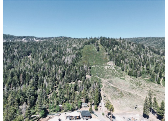
Drone photo of Homewood Mountain property taken from North Base area