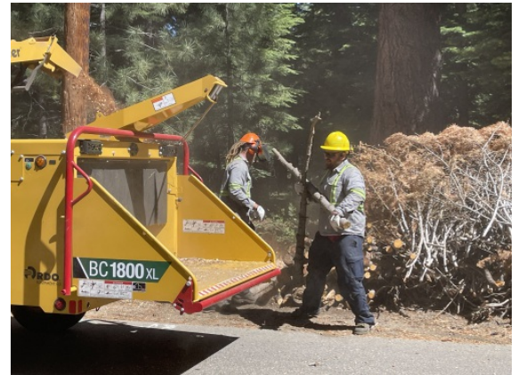
Crew Chipping Curbside