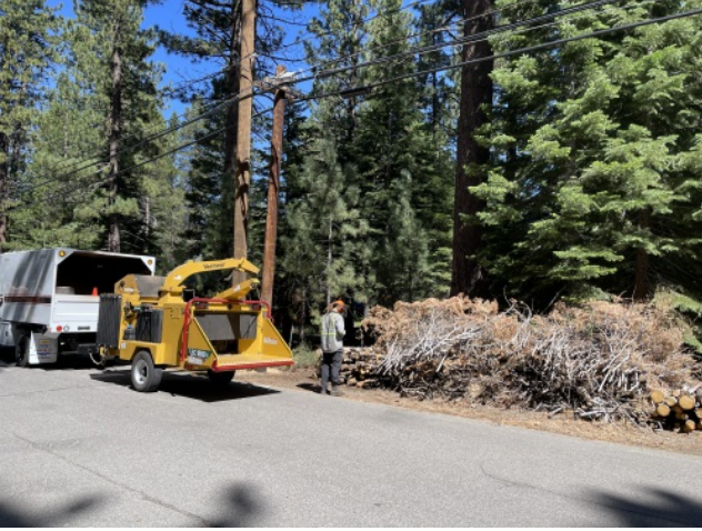
Curbside chipping program within the City of SLT for private residence work.

Project Fact Sheet Data as of 06/06/2025