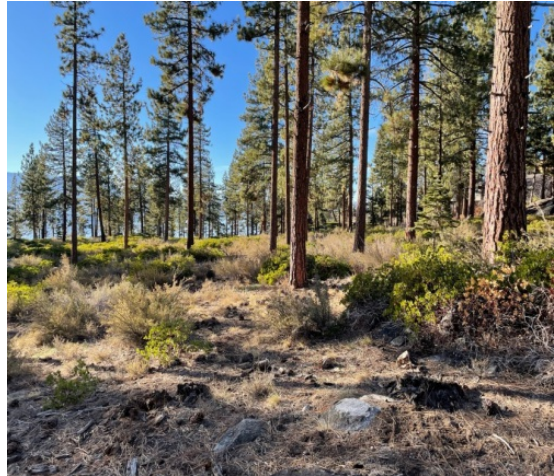
From center of project looking West