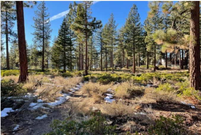
From power lines looking into the center of the project

Project Fact Sheet Data as of 06/13/2025