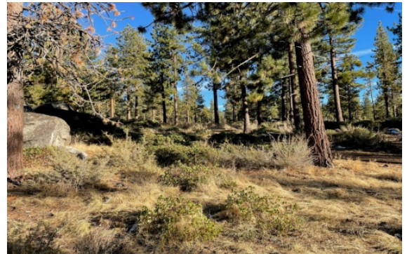
From the Skyland Dr. looking East (West end)

The Tahoe Douglas Fire Protection District will treat approximately 17 acres of US Forest Service lands to the South and East of the Skyland community. Treatment will consist of hand treatment and forest fuels mastication to create a "Shaded Fuel Break" as defined by the National Wildfire Coordinating Group; Fuel breaks built in timbered areas where the trees on the break are thinned and pruned to reduce the fire potential yet retain enough crown canopy to make a less favorable microclimate for surface fires.