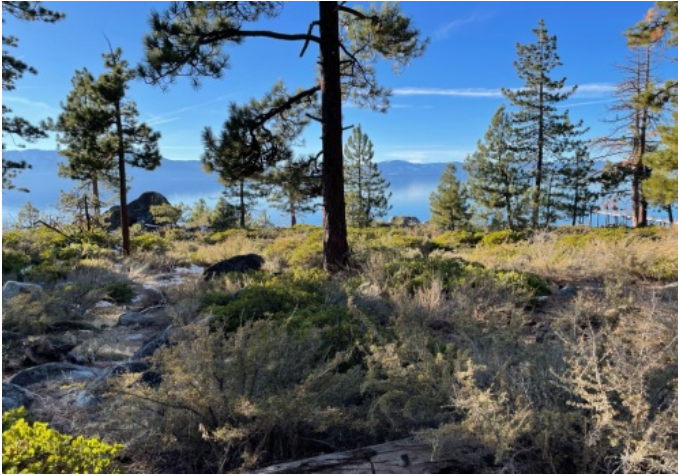
From Skyland Dr. looking West (West end)