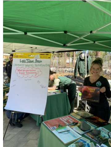
CWPP Coordinator attends Earth Day 2023 in South Lake Tahoe to engage community members on the Community Wildfire Protection Plan update.