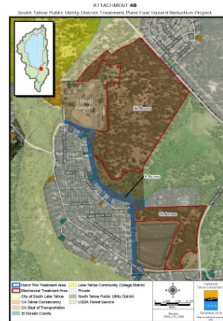
South Tahoe Public Utility District Treatment Plant Fuel Hazard Reduction Project