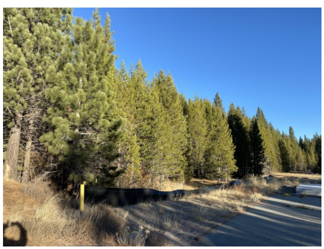
Before Photo of monoculture unhealthy forest along HWY 50