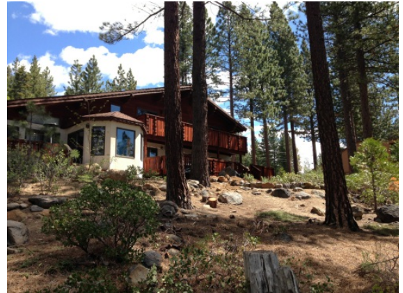
A Lake Tahoe Basin home within a managed community forest.

The member organizations of the Tahoe Fire and Fuels Team are partnering to implement a comprehensive, coordinated management strategy across 12,000 acres of community forests in the Lake Tahoe Basin. These forests contain over 15,000 federal, state, local government, and privately managed vacant lots interspersed among homes and critical infrastructure. The project enables all-lands defensible space, fuel reduction and forest restoration throughout vulnerable neighborhoods in the wildland-urban interface. Through public-private partnerships, residents are engaged in stewardship and monitoring, and efficiency is improved by prioritizing and sharing resources across jurisdictions.