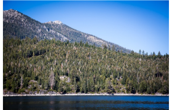
Tree Mortality on West Shore