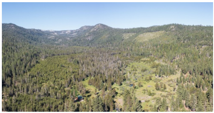
Meeks Meadow, Pre -Conifer removal

Project Fact Sheet Data as of 06/26/2024