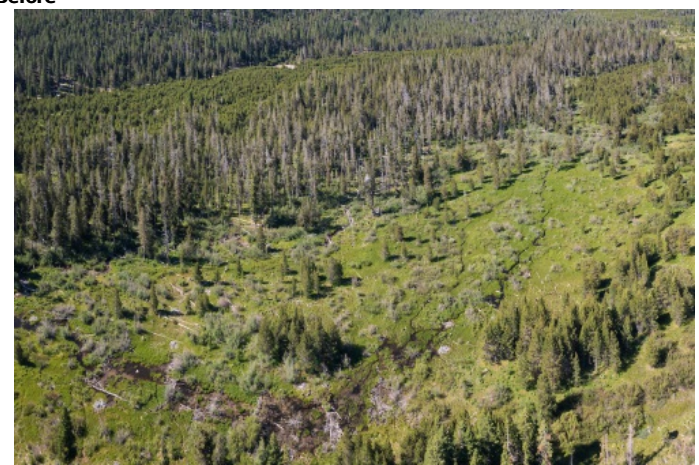
Meeks Meadow, Pre -Conifer removal