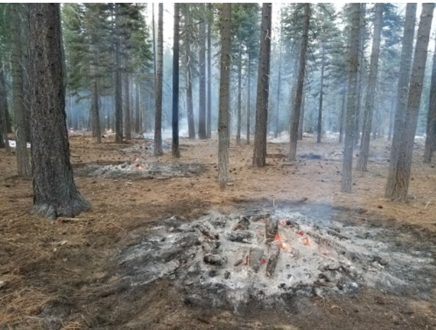
After Pile Burn