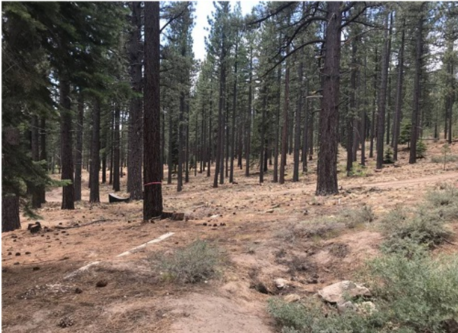
Sample Tree Stands Pre Treatment

Project Objectives The project photographs below indicate post-treatment stand conditions within the project area. Visual crown stands exhibit a high degree of separation of surface, ladder, and canopy fuels.