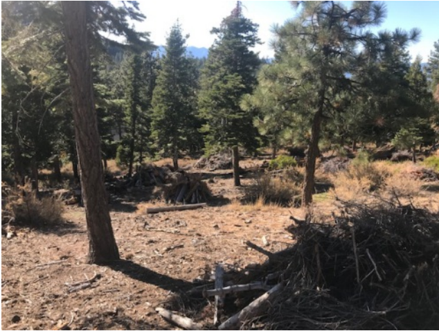
Hand Piles in Glenbrook