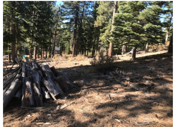
Hand Piles in Glenbrook