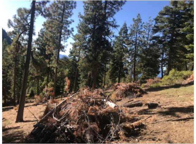
Hand Piles in Glenbrook

Project Fact Sheet Data as of 05/08/2024