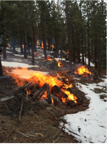
Spring Burning on Private Parcel

Project Fact Sheet Data as of 05/18/2024