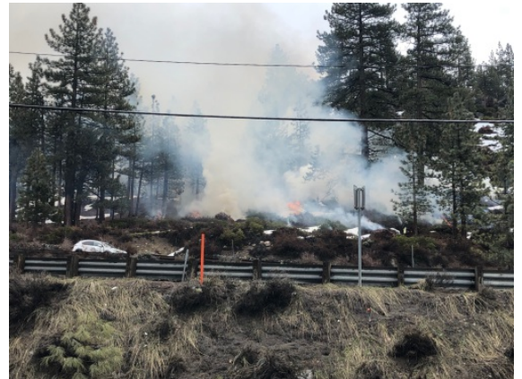
Burning along HWY 50 corridor