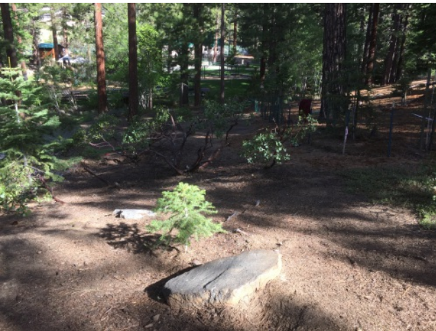
Hwy 28 and Winding Way site - adopted by local resident