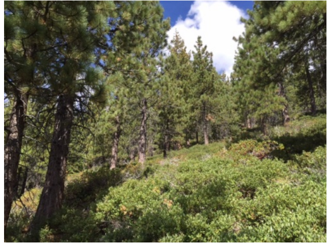
Continuous shrub cover at Champagne Site