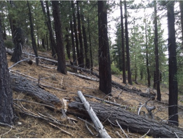
Dead and Downed 1000 hr fuels at Champagne Site