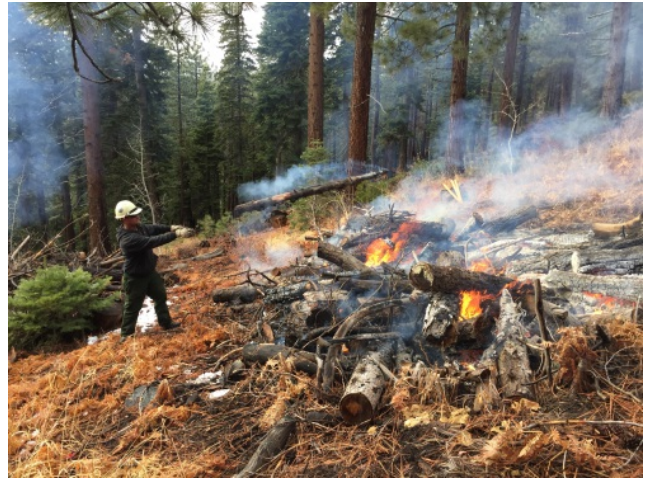
Feeding piles during burning