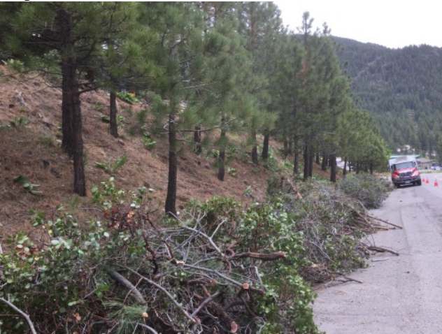
Debris piles to be chipped at Hwy 28 site