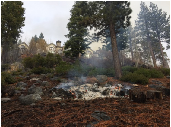
Pile burning near home

This project will reduce hazardous fuels and restore forest health on 20.5 acres of privately owned property within the Wildland Urban Interface of Incline Village, NV. There are 27 homes within and adjacent to the project area and 670 more homes within one-quarter mile. Two of the parcels serve to connect current and planned fuels reduction projects on federally owned land managed by the USFS. Crews will hand thin hazardous fuels to reduce potential fire behavior to a level that permits direct attack by first responders. Cut material will be piled and burned, or left on site in preparation for understory burning.