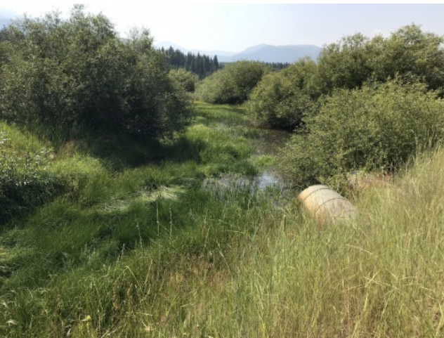
West Airport Drainage Outfall Structure Cleaning