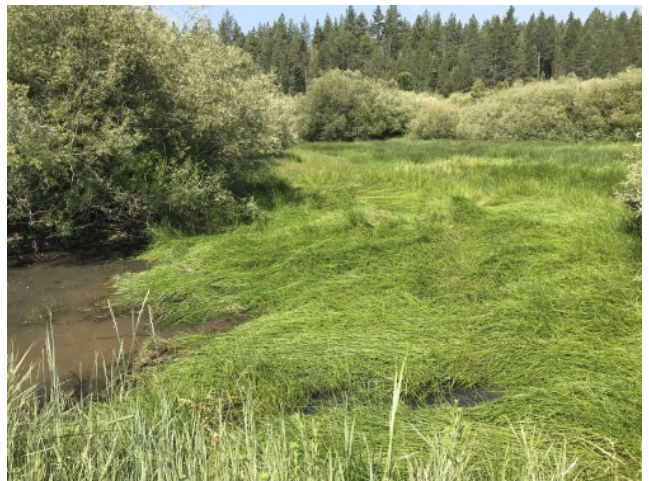
Allows for proper flow of settling ponds reducing sedimentation

Project Fact Sheet Data as of 05/05/2025