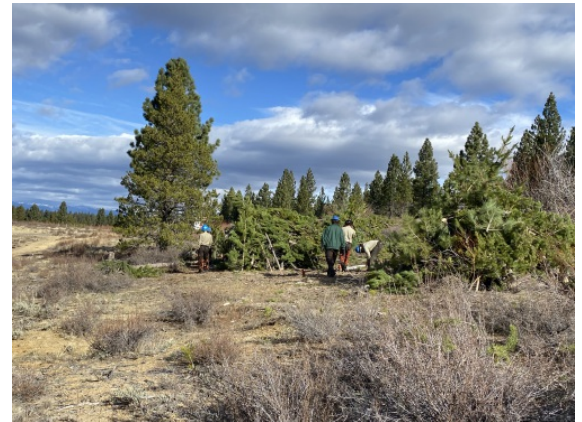
California Conservation Corps thinning trees less than 14" dbh