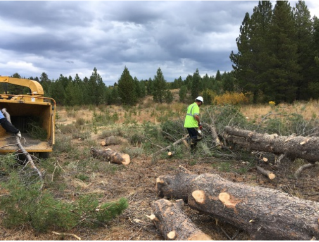
Fuel Reduction on Airport Property