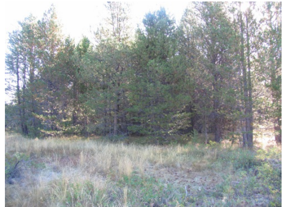
Dover project area before

The Dover Drive forestry project involves cutting of trees that were marked under the guidance of a Registered Professional Forester (RPF) for forest health and fuel reduction efforts. The project is being implemented by hand crews cutting designated trees and brush. The project involves the cutting and chipping of designated trees and brush. The project is located in the South Shore of Lake Tahoe and is approximately 5 acres in size.