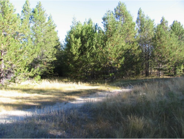
Dover project area before

Project Fact Sheet Data as of 05/12/2024