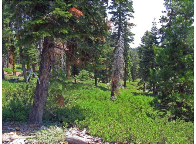
Fairway- dead fir and brush build up

Project Fact Sheet Data as of 05/18/2024