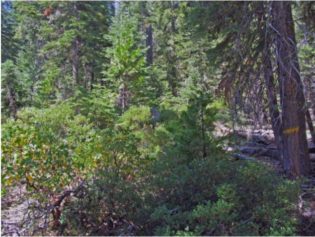
Bunker- brush/fuel build up