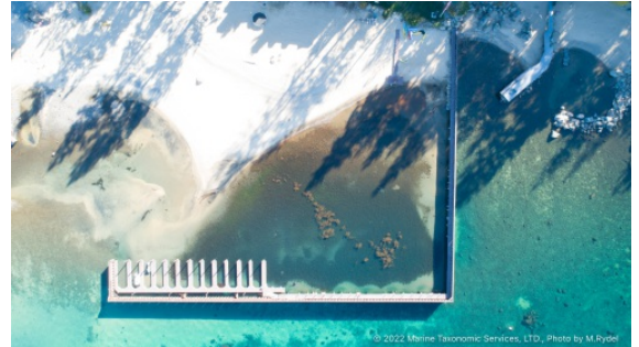
Aerial view of Logan Shoals aquatic invasive plant infestation, Glenbrook, NV, October 2022.