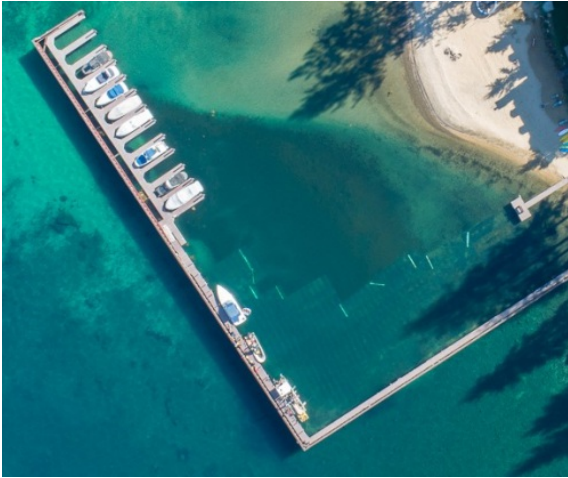
Aerial view of Logan Shoals aquatic invasive plant infestation during barrier installation, Glenbrook, NV, July 2023.