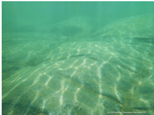
Eurasian watermilfoil covered with underwater barriers, south of Cave Rock, Nevada State Parks, NV, June 2023.

Project Fact Sheet Data as of 06/13/2025