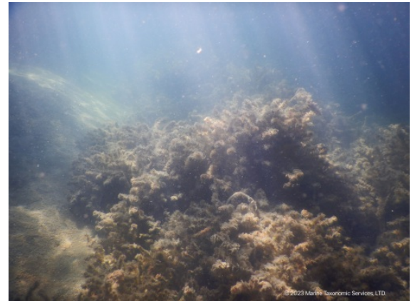
Eurasian watermilfoil before aquatic invasive plant removal, south of Cave Rock, Nevada State Parks, NV, June 2023.