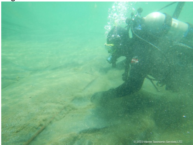
Diver securing underwater barriers, covering Eurasian watermilfoil infestation, south of Cave Rock, Nevada State Parks, NV, June 2023.